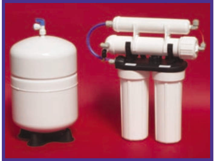
Domestic RO System