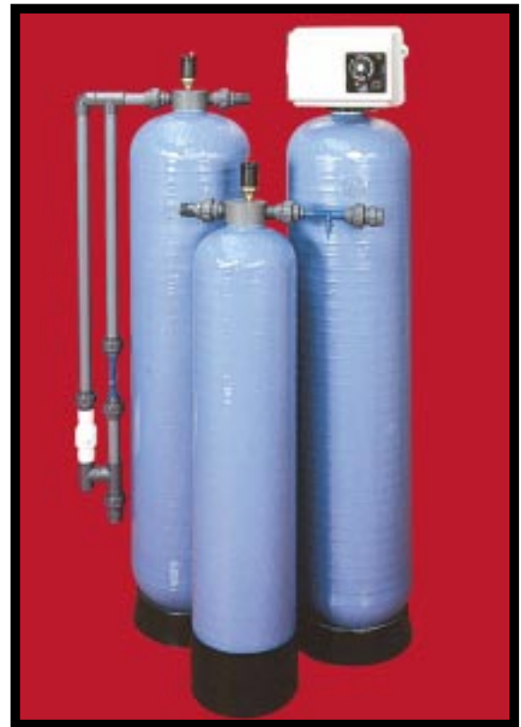
Fleck 2510 Valved Filter and 1354 Aerator Contact Assembly (rear) with 1044 Aerator Contact Assembly.

The Triplex vessel uses a unique blend containing a pH correction media, an Iron and Manganese removal media, and a physical filter media. This works in three ways and has the combined